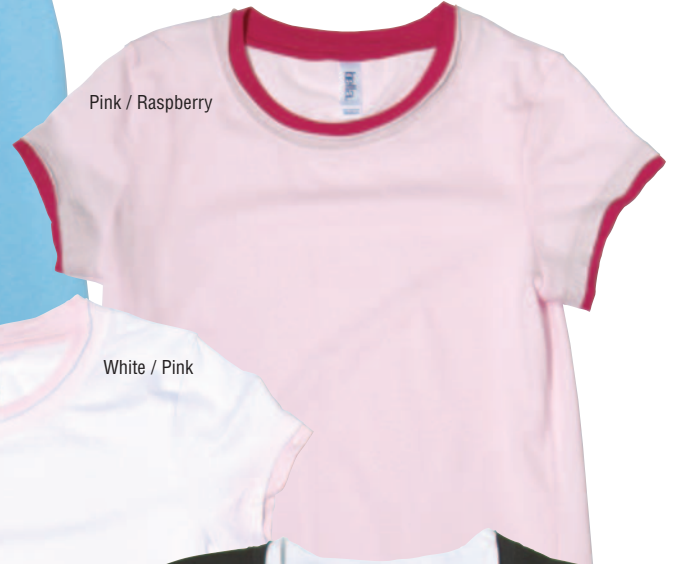
White / Pink